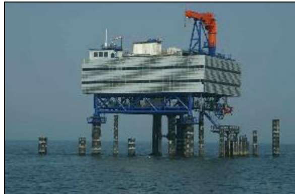
Off-shore transformer station, similar to what is proposed for Nantucket Sound

A simpler way to view the 26-page "Executive Summary" portion of the report is on the Three Bays Preservation web site at: www.3bays.org . Just follow the link to "DEIS Executive Summary".