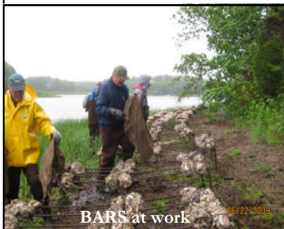
BARS at work

Mills River that connects Prince's Cove and North Bay. It is hoped that we can use these oysters as sort of guinea pigs to determine if these shellfish can help improve the water quality in the northern reaches of our watershed. While our recent water testing has shown that the water quality in Prince's and Warren's Coves has improved, there has been a large algae bloom of Ulva (sea lettuce) that has covered almost every square inch of these waters. To us it seems to be an indicator of a large nitrogen source.