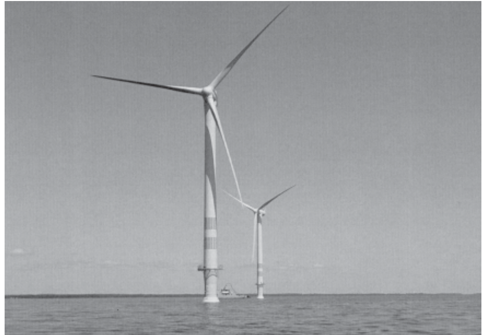
Typical Offshore Wind Generators.

The northernmost turbines would be more than 4 miles from Yarmouth, the southeastern most turbines would be about 11 miles from Nantucket, and the westernmost turbines would be about 5.5 miles from Martha's Vineyard.